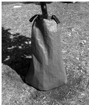
Figure 2. This product provides drip irrigation for trees through pinholes in a plastic pouch.

Besides the appearance of your plant, another way to gauge