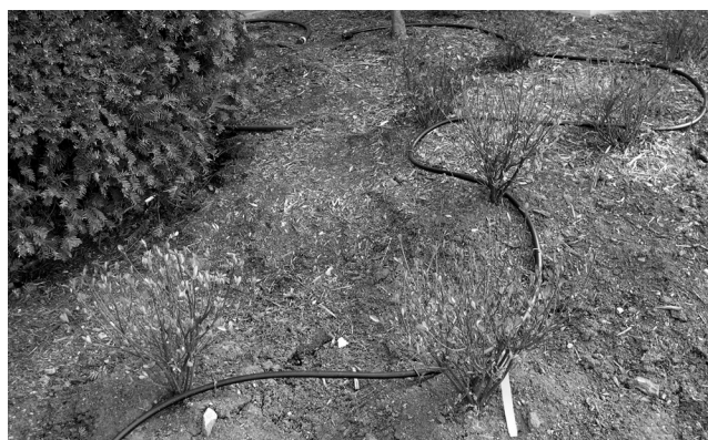
Figure 1. Drip irrigation delivers water slowly and efficiently to the root zone of plants, maintaining soil moisture in a drought.

It is common in Missouri to have above normal rainfall in April and May, leading to extended periods when the soil is saturated. These conditions, combined with the clay soils found in many landscapes, may lead to suffocation of deep roots even when plants are growing on slopes. Then, when the annual drought strikes, trees like sugar maple and pine are less capable than usual of coping with drought stress because their root systems are damaged. This situation may lead to a downward spiral in which a large tree, weakened by drought stress, is attacked by insects and diseases that normally pose little threat to plant health. Leaves may be sparse and smaller than normal, leading to a reduction in photosynthesis and a gradual starvation